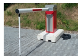
Mobile barrier ES-M