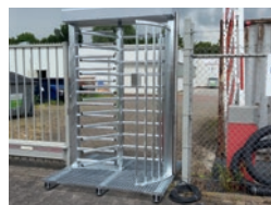
Turnstile DK 2-M hot-dip galvanized mobile