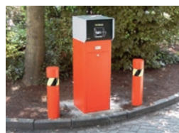
Housing for cars