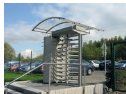
Turnstile stainless steel and electromechanic