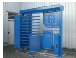
Turnstile with side passage