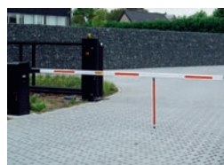
Barrier with swivel support