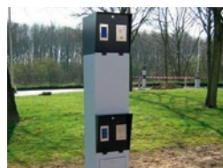
Housing for cars and trucks