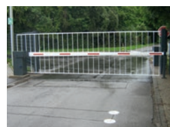
Barrier with curtain and induction loops