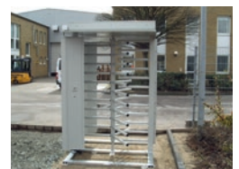
Turnstile with transport frame