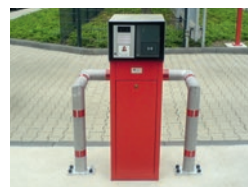
Housing for cars